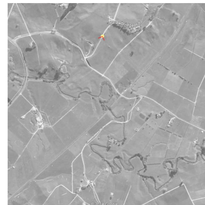
Map | Google Earth + Adobe Photoshop